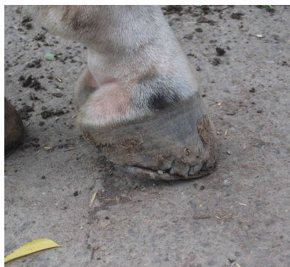
Brittle hooves, cracked due to nailing.