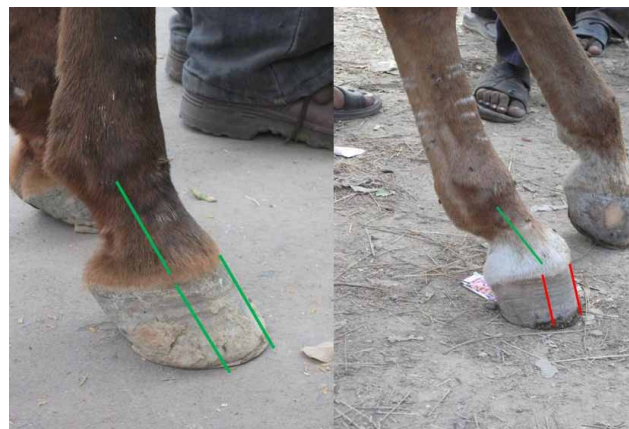
Conformation of hoof.