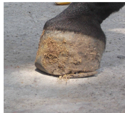
Sharp edge on shoe (middle) and bad hoof shape, broken forward.