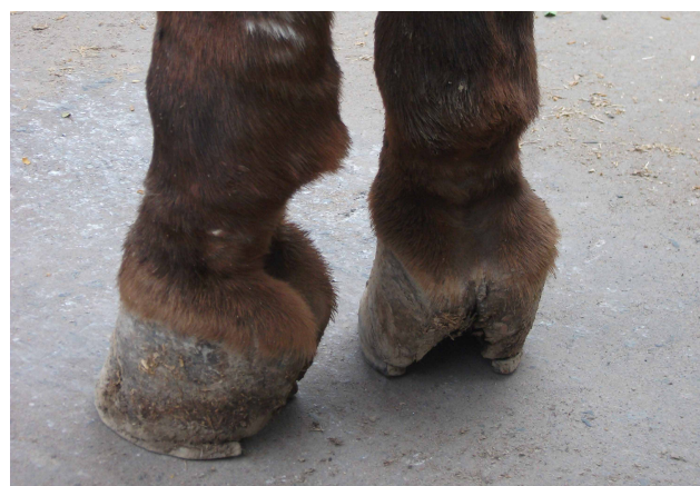
Badly contracted heels - frog unable to function.