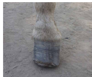
Poor hoof quality.