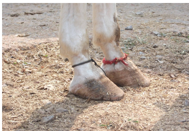
Bad hoof shape - broken back of the hoof.