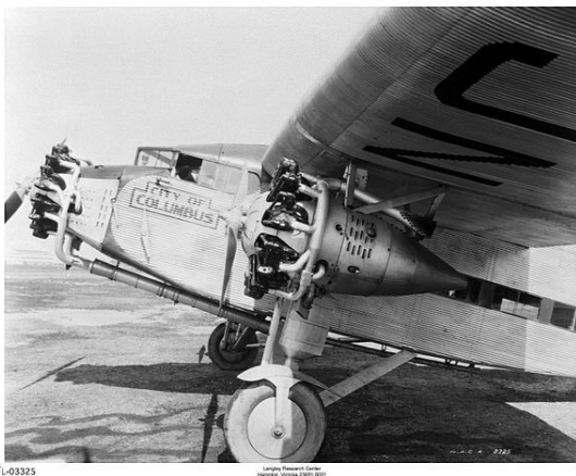
TAT Ford 5-AT-B flown by Lindbergh

Ford 5-AT-A Enlarged version, powered by three 420-hp (320-kW) Pratt & Whitney Wasp radial piston engines, accommodation for two pilots and 13 passengers, the wingspan was increased by 3 ft 10 in (1.17 m); three built.