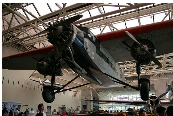
On display in Washington, DC

The heyday for Ford's transport was relatively brief, lasting only until 1933, when more modern airliners began to appear. Rather than completely disappearing, the Trimotors gained an enviable reputation for durability with Ford ads in 1929 proclaiming, "No Ford plane has yet worn out in service." [12] First being relegated to second and third-tier airlines, the Trimotors continued to fly into the 1960s, with numerous examples being converted into cargo transports to further lengthen their careers, and when World War II began, the commercial versions were soon modified for military applications.