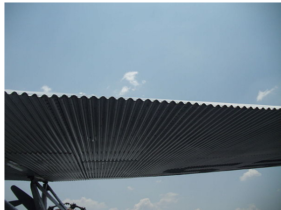
Corrugated wing of a 1929 Ford 4-AT-E Trimotor

Although designed primarily for passenger use, the Trimotor could be easily adapted for hauling cargo, since its seats in the fuselage could be removed. To increase cargo capacity, one unusual feature was the provision of “drop-down” cargo holds below the lower inner wing sections of the 5-AT version. [3][7]