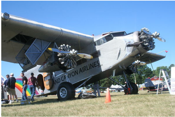
Grand Canyon Airlines Ford Trimotor (note the deployed wing cargo pannier)