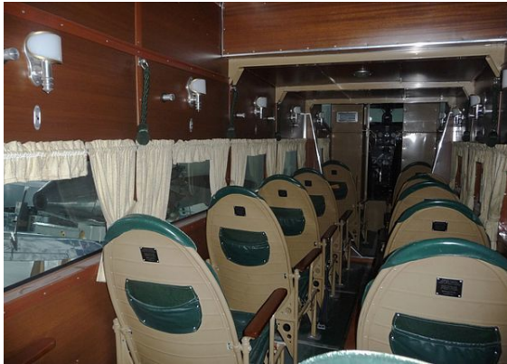
Ford Trimotor interior

The story of the Ford Trimotor began with William Bushnell Stout , an aeronautical engineer who had previously designed several aircraft using principles similar to, and originally devised by Professor Hugo Junkers , the noted German all-metal aircraft design pioneer.