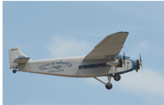
Restored 1929 Ford 4-AT-E Trimotor "NC8407" owned by the Experimental Aircraft Association (EAA) and painted in the colors of Eastern Air Transport

A total of 199 Ford Trimotors were built between 1926 and 1933, including 79 of the 4-AT variant, and 116 of the 5-AT variant, plus some experimental craft. Well over 100 airlines of the world flew the Ford Trimotor. [1] From mid-1927, the type was also flown on executive transportation duties by several commercial nonairline operators, including oil and manufacturing companies.