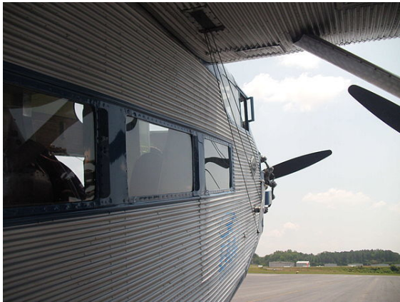
Externally mounted control wires of a Ford Trimotor

Like Ford cars and tractors, these Ford aircraft were well-designed, relatively inexpensive, and reliable (for the era). The combination of a metal structure and simple systems led to their reputation for ruggedness. Rudimentary service could be accomplished "in the field" with ground crews able to work on engines using scaffolding and platforms. [5] To fly into otherwise-inaccessible sites, the Ford Trimotor could be fitted with skis or floats. [5]