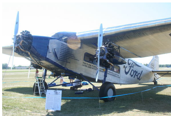
1927 4-AT-A, Serial No. 10, C-1077