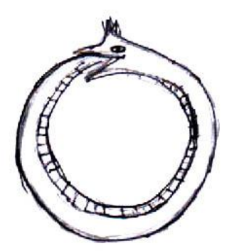
Figure 3: A snake consuming its own tail - the appearance of an Ouroboros

Though it was Michael Faraday who isolated Benzene in 1825 and assumed its empirical formula to be CH. Later In 1834, the German chemist Eilhard Mitscherlich found that benzene's formula was C_6H_6 . It was not until in 1865, Friedrich August Kekulé (1829-1896) proposed a structure for benzene, consisting of alternating single and double bonds which is cyclic. This is for the first time it had been proposed that a hydrocarbon chain actually formed a ring. Later in 1890 in a meeting Kekulé revealed that his inspiration of the cyclical structure of benzene came from a dream of a snake consuming its own tail - the appearance of a Ouroboros [15] (Figure 3)