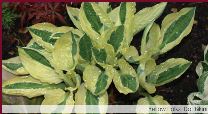
Yellow Polka Dot Bikini