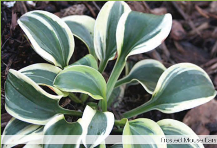
Frosted Mouse Ears