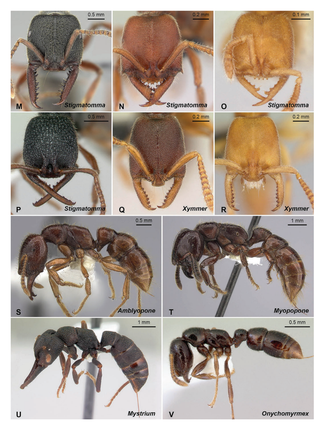
Fig. 1. Continued.

no missing fragments (Table S1, Supporting Information). Of the 847 sequences, 675 were newly generated for this study (GenBank accession numbers KU671399-KU672073).