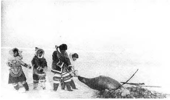
FIGURE 2. Peter Pitseolak and family pulling an ujjuk (bearded seal) from its breathing hole, 1944. Photograph taken by Aggeok with the camera set by Pitseolak. Montreal, McCord Museum (Photo: McCord Museum).

The photographic section alone would have made an interesting and complete exhibition.