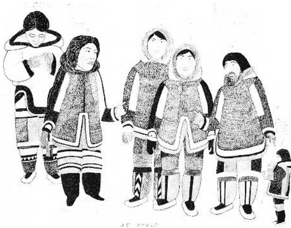
FIGURE 3. Peter Pitseolak. Untitled (reconstruction of past family event). Graphite, coloured pencil, and felt pen on paper, 50.7 × 65.5 cm. Cape Dorset (Baffin Island), West Baffin Eskimo Co-operative.

watercolours were Inuit figures with magazine photograph faces pasted on in a most amusing way; in both media, repetitiveness became a hallmark, not because Pitseolak was lazy, but because, uninfluenced by our notions of artistic creativity, he believed that if he 'got it right' in one composition, the same image would serve in the next.