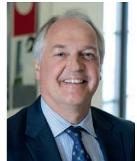
PAUL POLMAN CEO AND BOARD MEMBER UNILEVER NV

“Boards should support organisations in making a difference, both in financial terms and in infusing a sense of purpose and broader societal responsibility.”