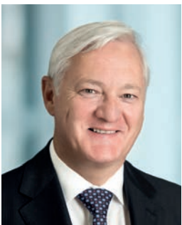
PETER VOSER CHAIRMAN ABB LTD

“Boards need to become more mindful due to increasing regulatory demands, shareholder activism, digitisation and other mega trends. Non-executives must be both diligent watchdogs and forward-looking strategists.”