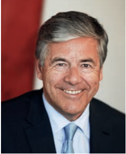
JOSEF ACKERMANN CHAIRMAN BANK OF CYPRUS HOLDINGS PLC

Our Advisory Board members have a strong commitment to advancing boardroom leadership and effectiveness.