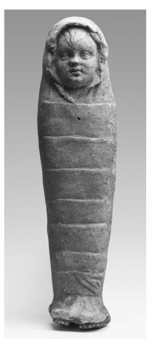
Fig. 1.1 Terracotta votive infant in swaddling clothes from a sanctuary in Italy.

insight into the developing and invested personhood of children younger than one year old. Terracotta ex votos of swaddled babies that were commonly dedicated in central Italian sanctuaries from the fourth to the second centuries BC, for example, reflect the specific anxiety felt by parents in the first two or three months of an infant's life (Fig. 1.1). Once the baby had successfully negotiated this dangerous postnatal period and was released from its swaddling bands, its effigy as an individual in society and in the religious