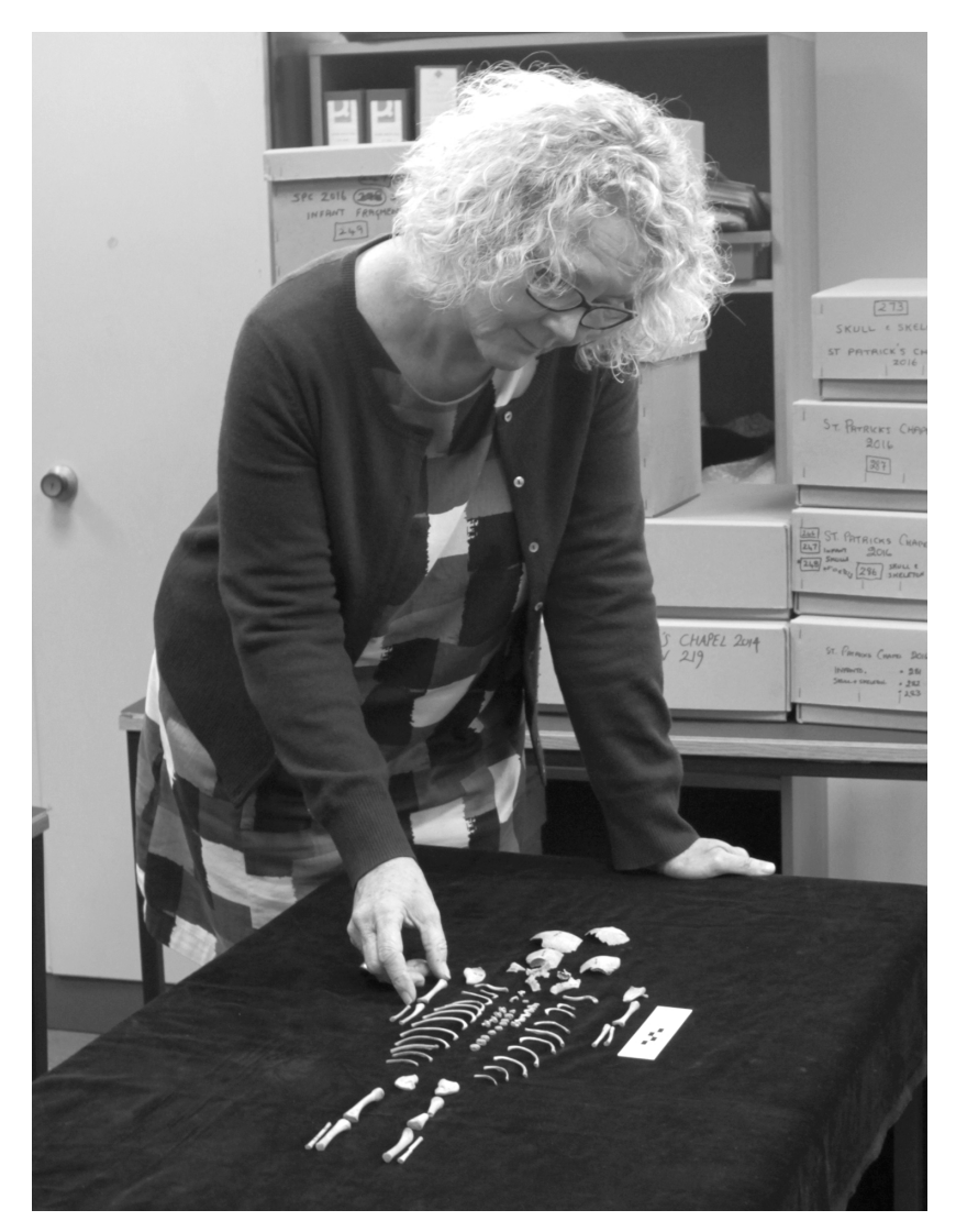
Fig. 1.2 The author with the skeleton of a premature infant (thirty weeks' gestation), from an historical reference collection curated by the Department of Archaeology, University of Sheffield.